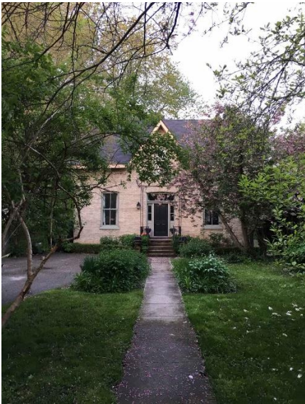
(1) Front path when you arrive.