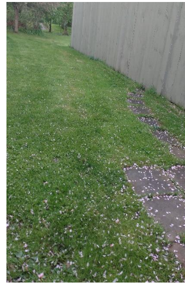
(3) After the turn area, a large grassy area leading to the backyard.