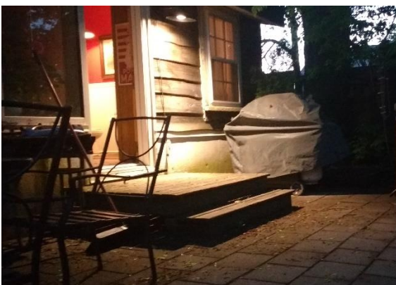
(7) Entrance to washroom, located close to (4). The patio is on the same level as the grass. These stairs will be removed and replaced with a ramp. We have been advised that longer ramps are best, so we will arrange this space with that in mind. The washroom is directly to the right of the door.