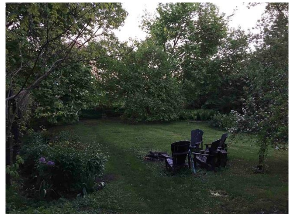
(6) The audience area, where you can either watch the show or gaze at a yellow magnolia tree!