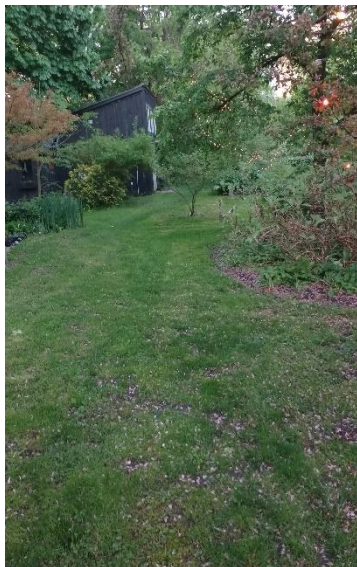
(4) In the backyard – a long, grassy area you follow to the 'stage' area. Note there is some bumpiness here.