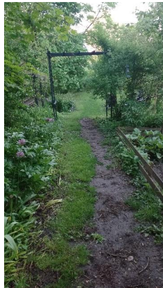
(5) After a bit of a decline, you come to a slight incline through this archway. This photo was taken after a rain, but even damp, the ground here is firm.